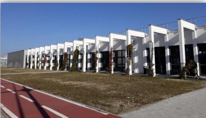
Aule delle Scienze