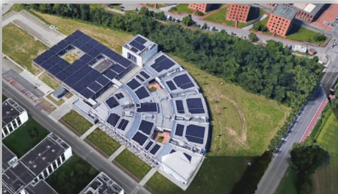
Aule delle Scienze Buildings