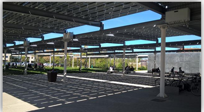
Photovoltaic square in front of the Conference Center