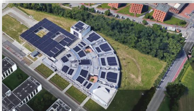
Aule delle Scienze Buildings