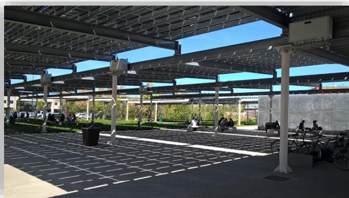
Photovoltaic square in front of the Conference Center